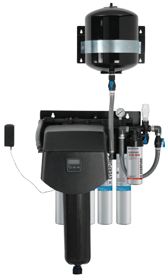
Endurance High Flow Quad: EV9437-42

ALL THE BENEFITS OF THE ENDURANCE PLATFORM PLUS ULTRAFILTER MEMBRANE-BASED PRETREATMENT